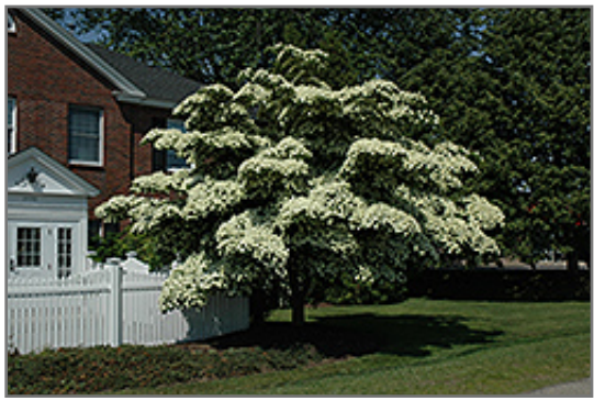
Chinese Dogwood in bloom

This is a relatively low maintenance tree, and should only be pruned after flowering to avoid removing any of the current season's flowers. It is a good choice for attracting birds to your yard. It has no significant negative characteristics.