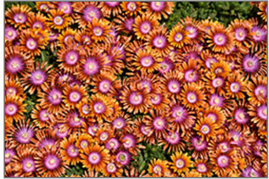
Fire Spinner Ice Plant in bloom

Fire Spinner Ice Plant is recommended for the following landscape applications;