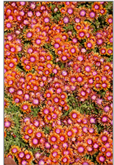
Fire Spinner Ice Plant flowers