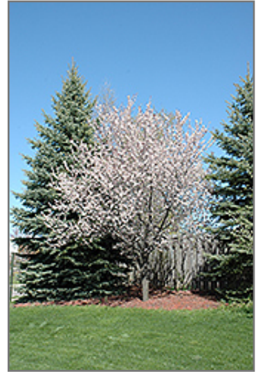
Newport Plum in bloom

This tree should only be grown in full sunlight. It does best in average to evenly moist conditions, but will not tolerate standing water. It is not particular as to soil type or pH. It is highly tolerant of urban pollution and will even thrive in inner city environments. This is a selected variety of a species not originally from North America.