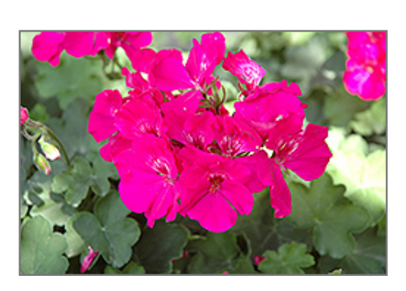
Calliope Lavender Rose Geranium flowers

Large flowers with stunning color; extremely well branched with a vigorous, mounding habit; ideal for large pots, containers, and landscape applications