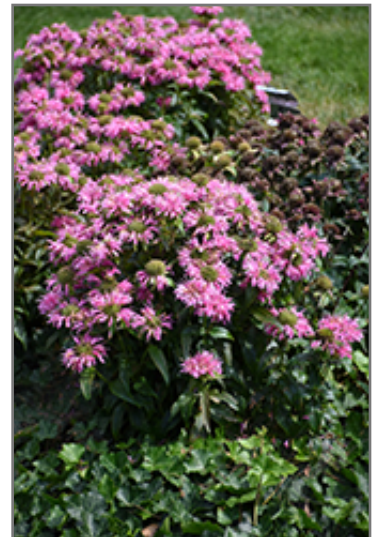
Pardon My Pink Beebalm in bloom