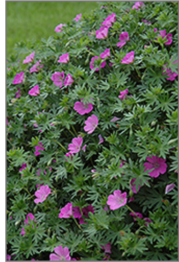
Bloody Cranesbill flowers