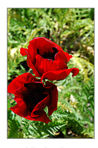
Brilliant Poppy flowers