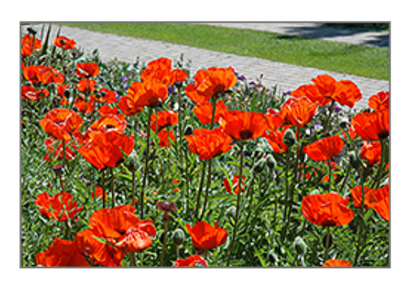
Brilliant Poppy flowers