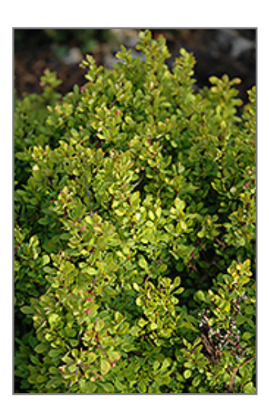
Golden Nugget Japanese Barberry foliage