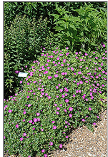
Max Frei Cranesbill in bloom