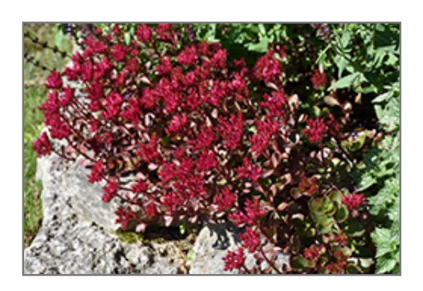
Voodoo Stonecrop in bloom

Voodoo Stonecrop is recommended for the following landscape applications;