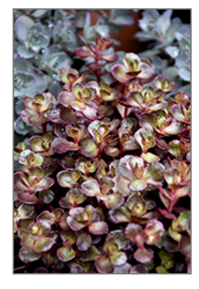
Voodoo Stonecrop foliage