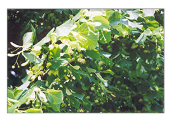
Littleleaf Linden flowers