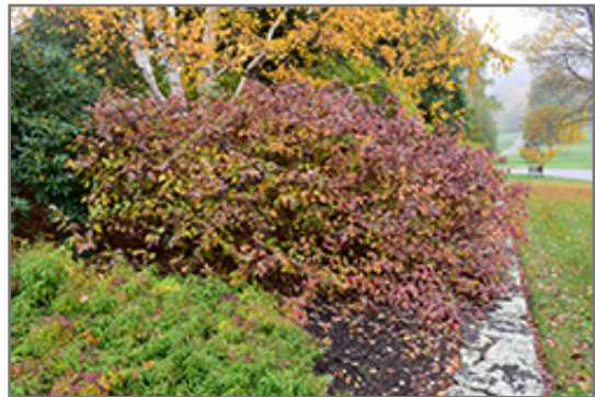
Bailey Red-Twig Dogwood in fall