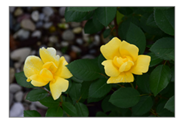
Sunny Knock Out Rose flowers

1000 W Chestnut St, Union City, IN 47390