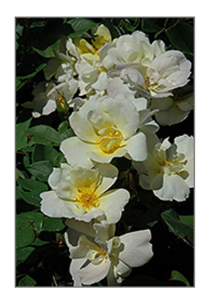
Sunny Knock Out Rose flowers